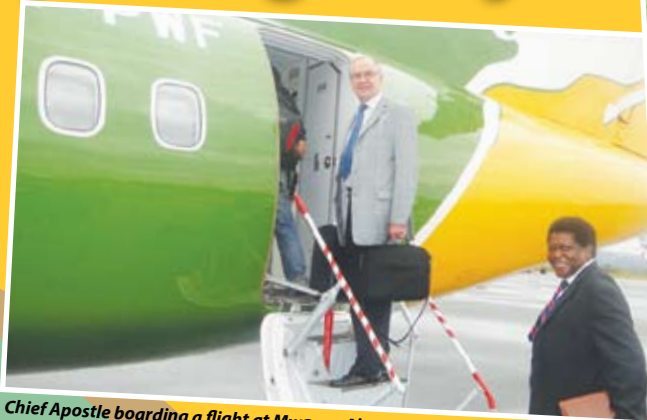
Chief Apostle boarding a flight at Mwanza Airport to Zurich via Nairobi, after his visit in Tanzania.