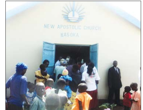
New church building for Kasoka in Uganda was dedicated on 27 th April 2012.