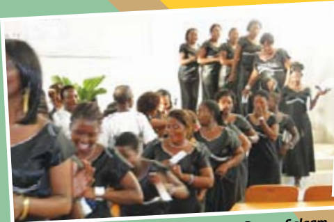
Joyful choir members after the concert at Dar-es-Salaam with the chief Apostle.